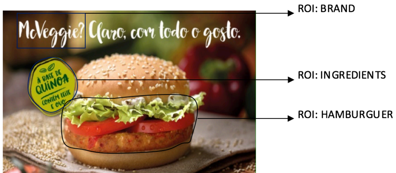
Figure 1: Region of Interests (ROI's)

The experiment consisted of three exactly alike images of the McVeggie hamburger, preceded by a fixation cross (500 ms), where we manipulated the description of the hamburgers. One of the images showed "Juicy Taste", another "Quality of Life" and the latter "Healthy Longevity". Each image was displayed for 15 seconds, followed by a question about how attractive the subject considered the burger, in a 1-7 Likert scale. The order of the images was counterbalanced. While they were performing the task, eye movements were recorded with an Eyetracking device. The Regions of Interest used in the present study are shown in figure 1.