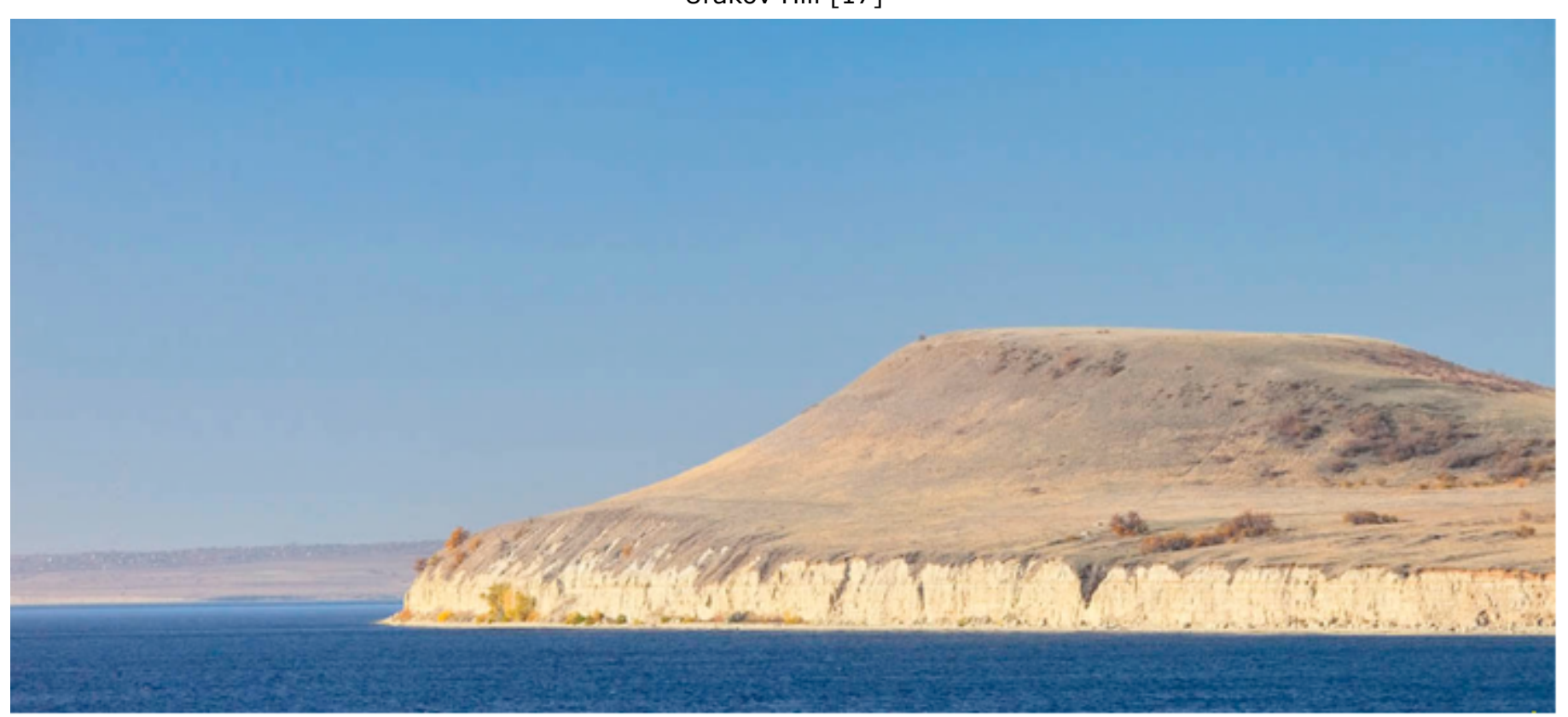
Figure 6 Urakov Hill [17]