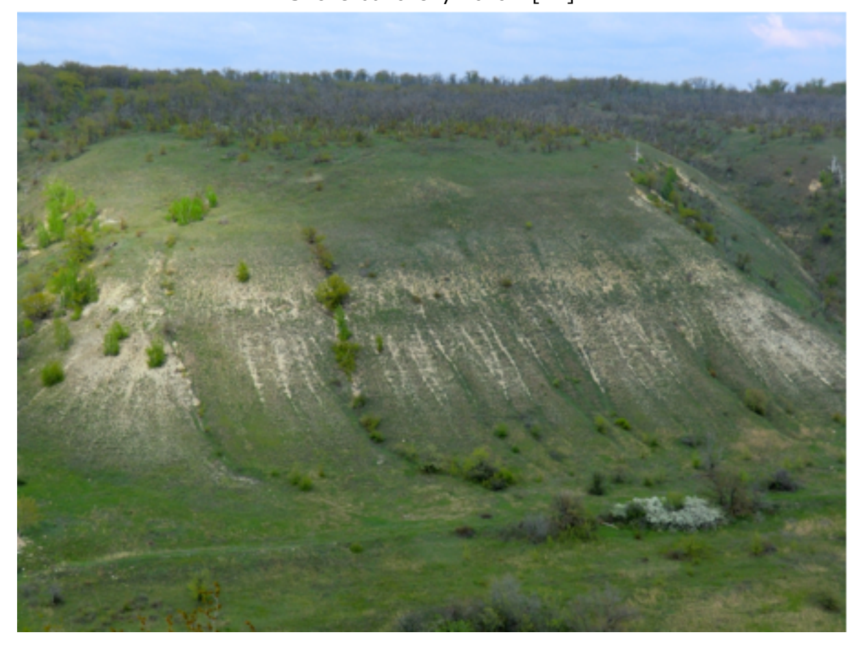
Figure 3 Shcherbakovsky hollow [14]

The most well-known location of the natural park is natural monument ироды Shcherbakovsky hollow (Figure 5); its age is about 50-60 million years, and depth of the ravine – 200 meters. Here flows the only mountain river of Volgograd Oblast - Shcherbakovka (Figure 4); due to its quick current, the air remains cool even in symmer. The hollow is a home to plants and animals from the Red Book.