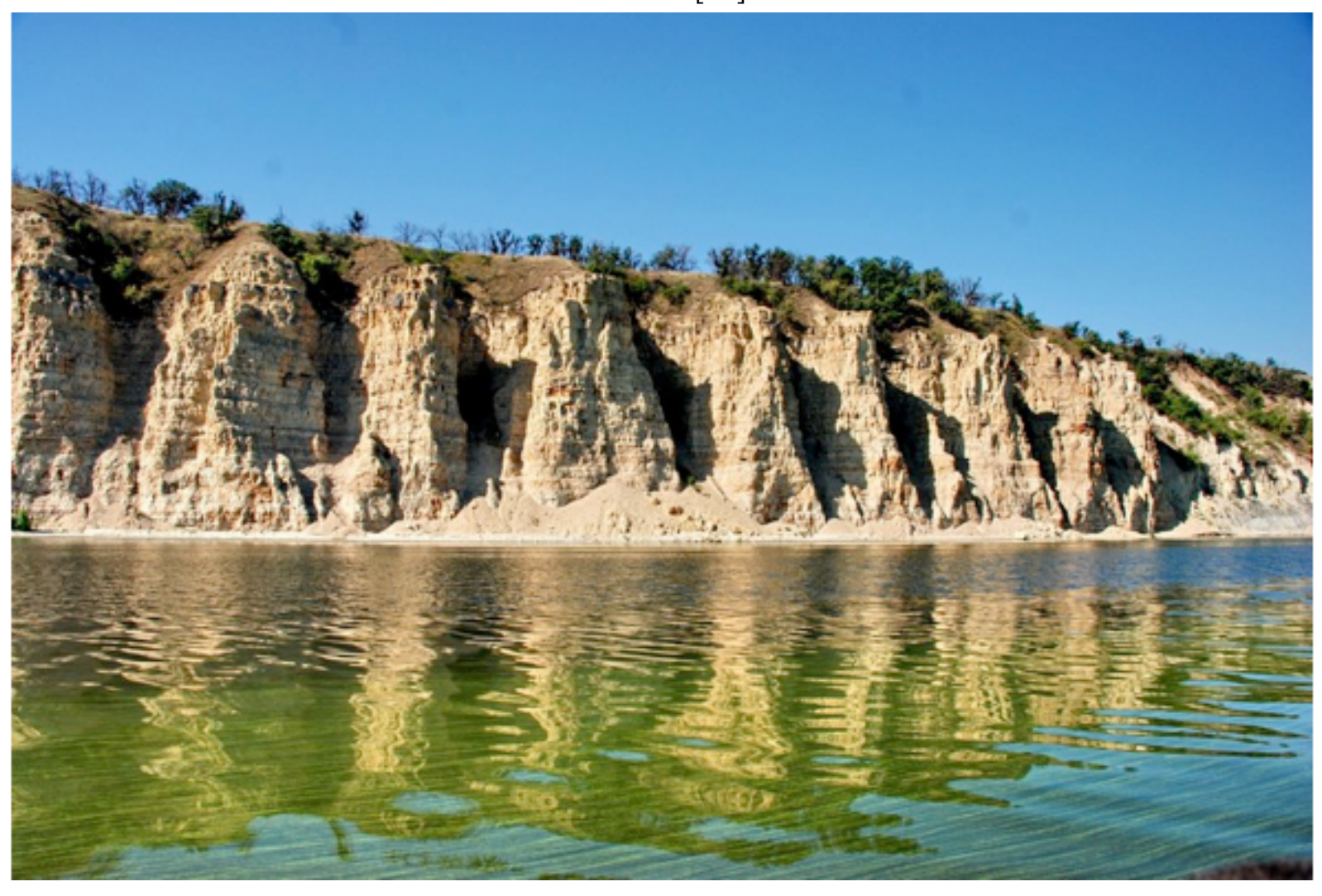
Figure 5 Stolbichi [16]

Another natural landmark, Urakov Hill is a very interesting site, known for the large number of artifical caves. Their origin is still unknown – from the historical point of view. According to the legends, the Khan Urak lived here – a master of local lands. He was killed in a battle by Stepan