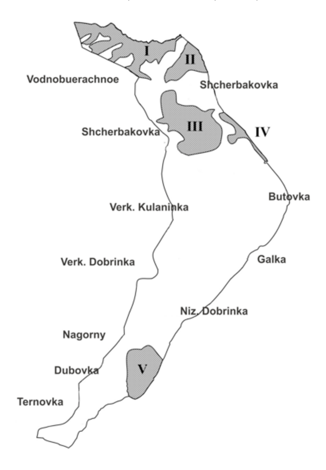
Figure 8 Local reserves of the territory of Shcherbakovsky natural park

- Local reserves. I – Danilovsky; II – Krivtsovsky; III – Shcherbakovsky; IV – "Stolbichi" and "Shcherbakovsky trap-down"; V – Urakovsky